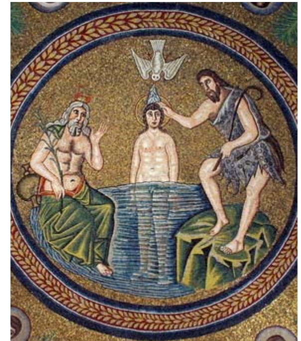
The Baptism of Christ (Mosaic, ca. 490 AD) (Battistero degli Ariani, Ravenna, Italy)