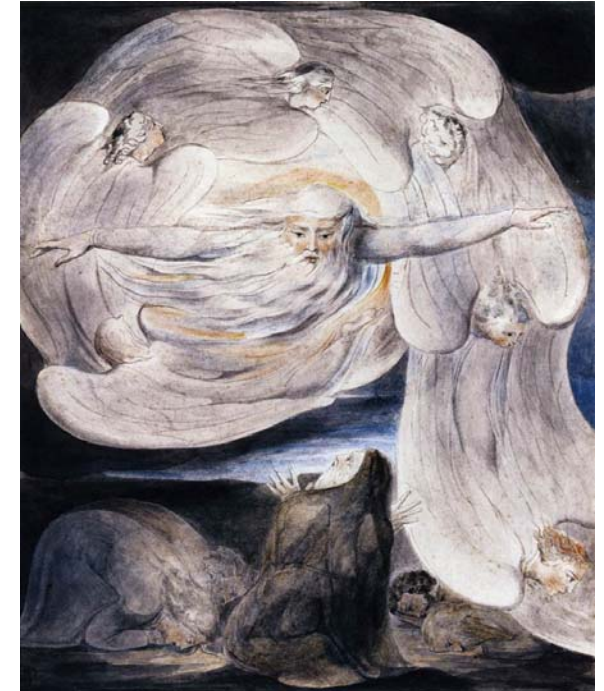
Job Confessing His Presumption to God Who Answers from the Whirlwind

William Blake (1757-1827) ca. 1804 pen, ink, and watercolour (39 x 33 cm)