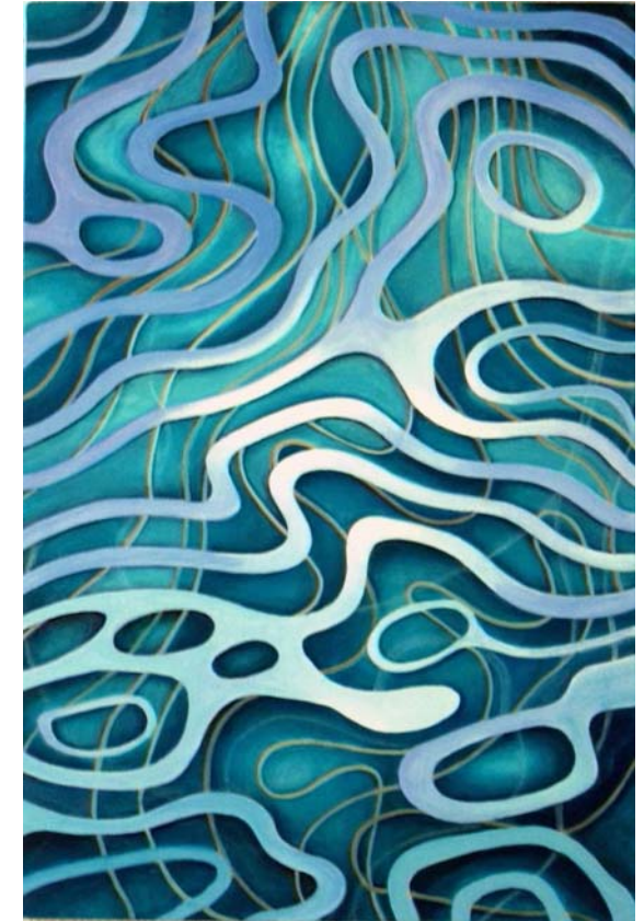
Ann Kopka, "Light Water 1" (2007) acrylic on canvas, 76 x 51 cm