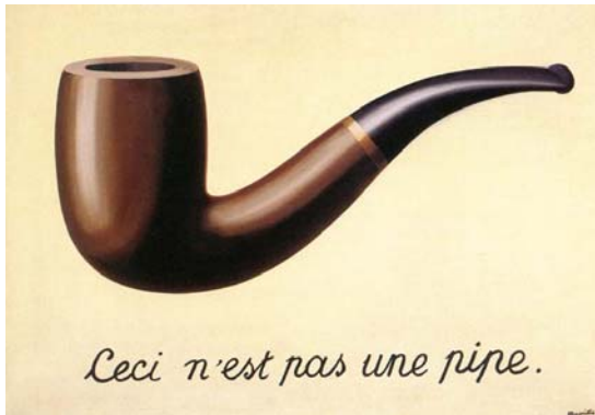
« La trahison des images » René Magritte (1898-1967)