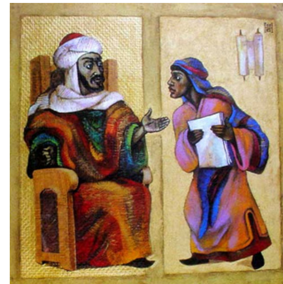
"The Shrewd Manager" Anonymous Arab painting of the parable in Luke 16:1-13