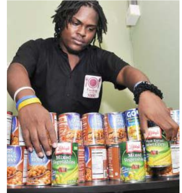
Feeding of the 5000 Outreach Foundation, Jamaica