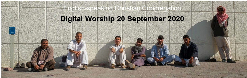
Image: Day labourers in Doha, Qatar waiting for work