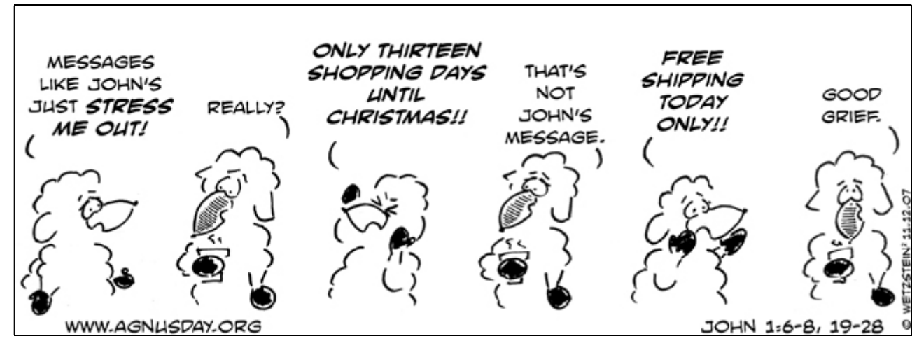
More lectionary cartoons at: https://www.agnusday.org

ECC Bank Account: "Englische Gemeinde" IBAN: DE89 4305 0001 0001 4132 36 SWIFT-BIC: WELADED1BOC (Sparkasse Bochum)