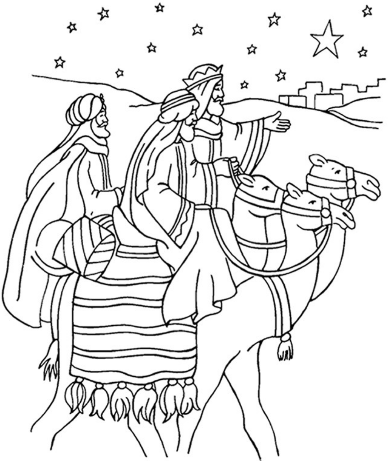
Wise Men Worship Jesus Matthew 2

From Thru-the-Bible Coloring Pages for Ages 4-8. ©1986,1988 Standard Publishing. Used by permission. Reproducible Coloring Books may be purchased from Standard Publishing, www.standardpub.com, 1-800-543-1301. Sermons4Kids.com