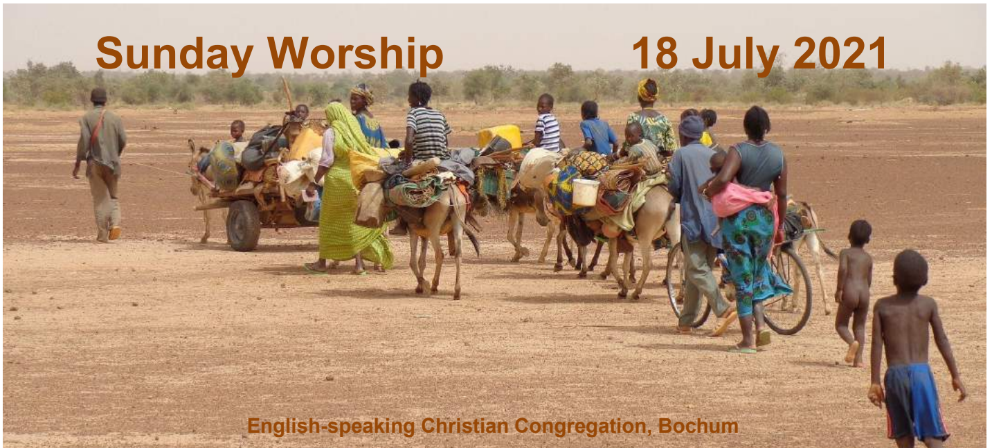
English-speaking Christian Congregation, Bochum